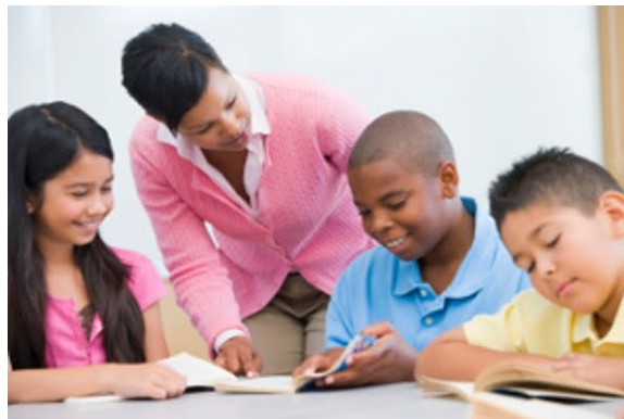
Personalized learning and onsite tutoring.

Innovation - Embracing current methodology and approaches, adapting to change